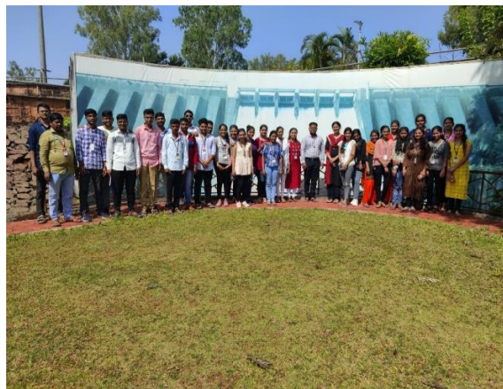
Visit to Nehru Park at Koyna DAM”